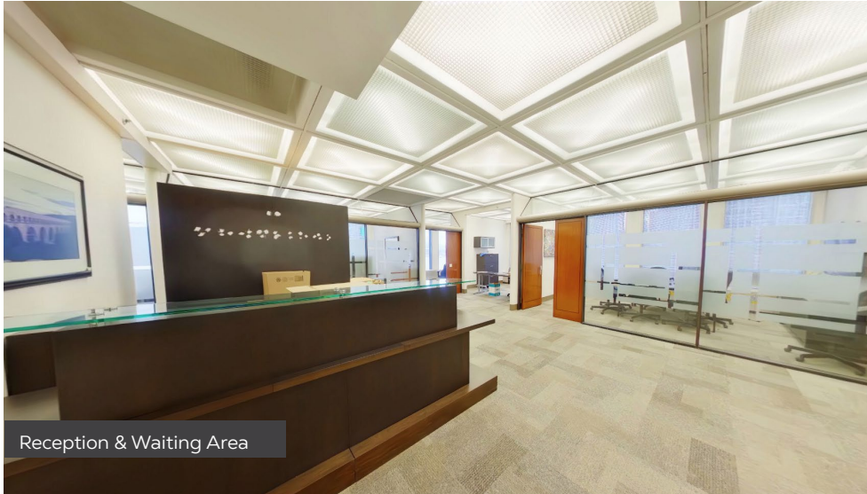
Reception & Waiting Area